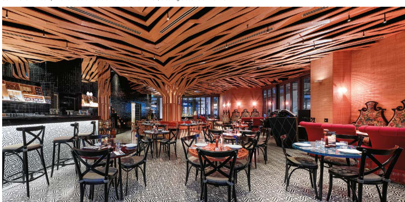
SUPERSYSTEM compliments the architectural framework of Almaz, creating a scenic environment.

LUXMATE PROFESSIONAL ensures easy control of the lighting solution throughout the restaurant. CLEAN provides excellent lighting in the kitchen, whilst PANOS infinity and MICROS deliver general lighting in the back-of-house areas.